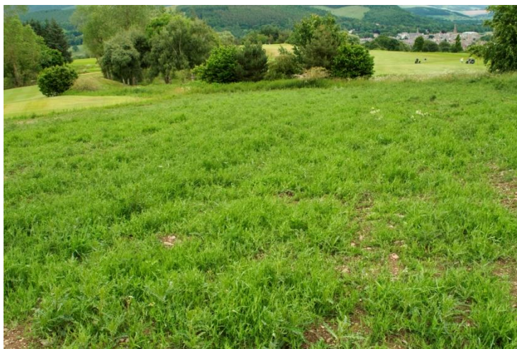
First signs of flowers. Meadow Vetching